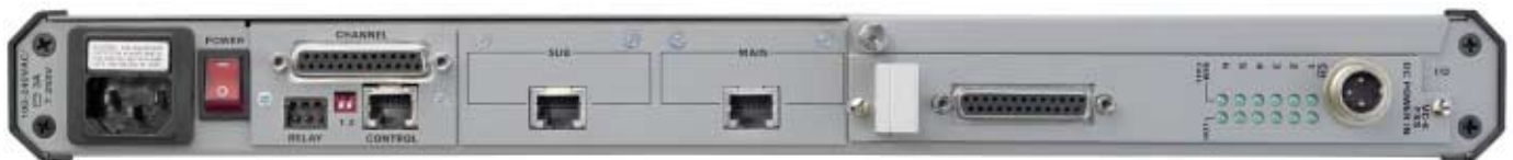
FCD-T1M Rear Panel